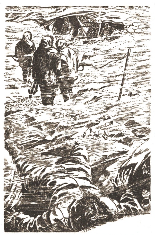
The food thief rated no grave. He was left where the party's bullets felled him.