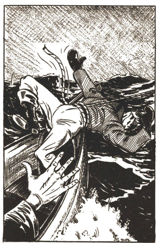
The outrunning coils had whipped a turn around the harpooner's body.